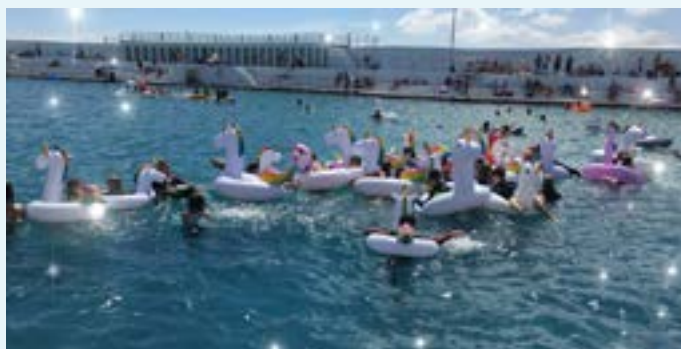
A unicorn derby day at Jubilee Pool